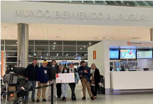
A warm welcome to Montevideo!!!

Stay tuned to learn about how God is working in Uruguay!!!