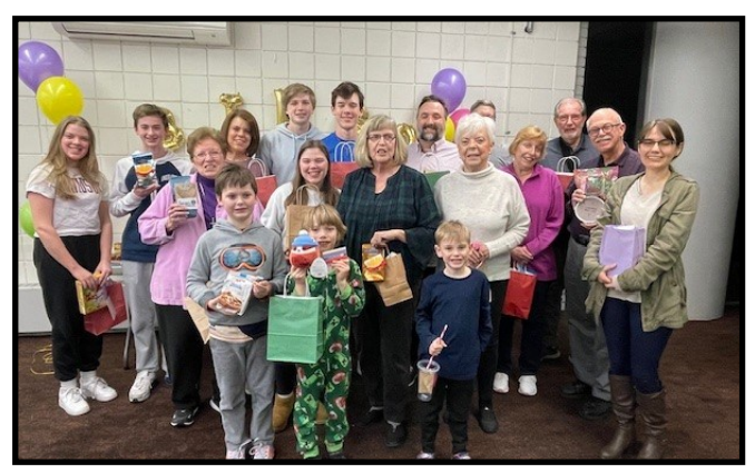
More than 60 members and guests came out for Zion's Bingo & Potluck Night on Friday 3/1. The lucky winners posed with their prizes at the end of the festivities. A great time was had by all!