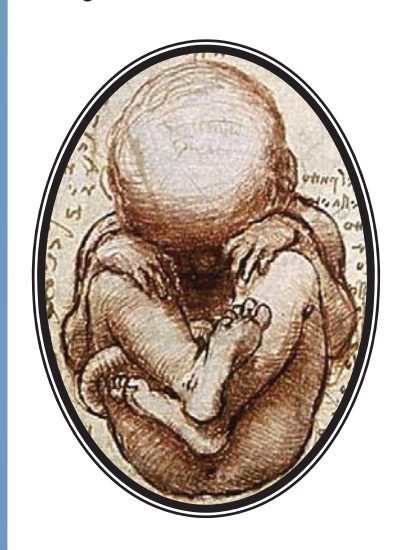
Leonardo da Vinci, 15th Century

"Before I formed you in the womb I knew you." -Jeremiah 1:5a