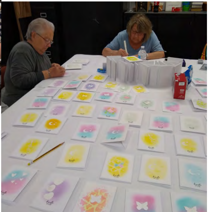
Right: Ladies from Mt. Calvary's Outreach design cards for the group's Genesis project