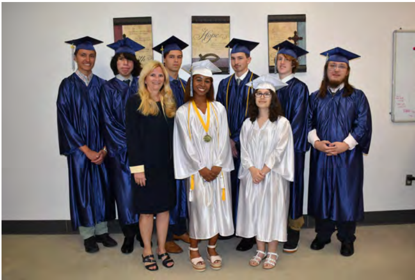
Top-Left/Middle Left: The RLHS graduating class of 2022! Hats off to 2022!