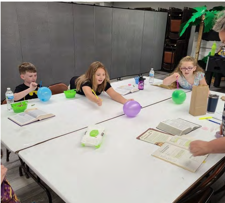
Left: Children at Mt. Calvary enjoy a Sunday School activity while learning about the Holy Spirit

The Outreach Group is taking a break from its weekly meetings and is just getting together once or twice a month during the summer, but members were busy with a project prior to that. Over the previous weeks, they were putting together tote bags for Genesis of Pittsburgh, filled with items for newborns such as diapers, baby wipes, bibs, and onesies. Genesis is dedicated to providing services to pregnant women, children, and adoptive families. Items for the babies also include handmade note cards fashioned by the group, a Bible, and a children's book from Concordia. For members of the congregation who would like to contribute, the group is asking for monetary donations so items can be bought in bulk and all bags will contain the same articles. They will be delivered to Genesis in the fall.