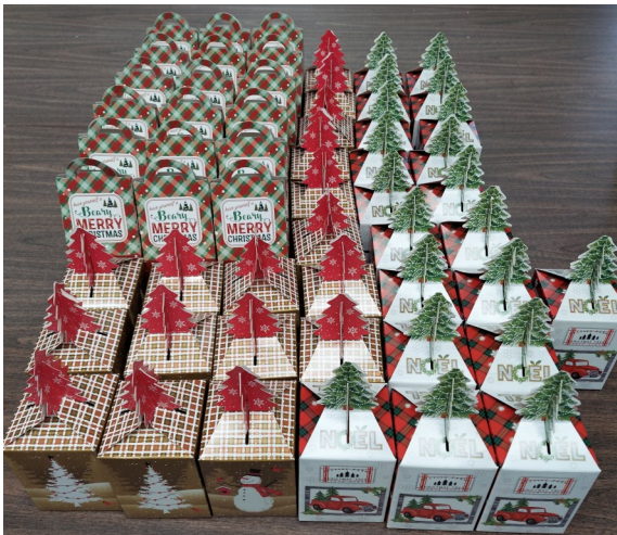
Top Left - Mt. Calvary's Outreach Group designed little boxes to hold treats for people who are on Meals on

Like most others, Mt. Calvary made the best of a situation over which we had no control. But in the midst of it all, we remember that Jesus is Immanuel - God with us - and still sits on the throne.