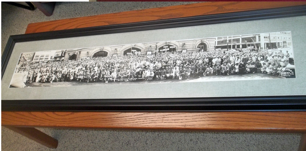
1936 Houston, TX gathering, International Walther League Convention