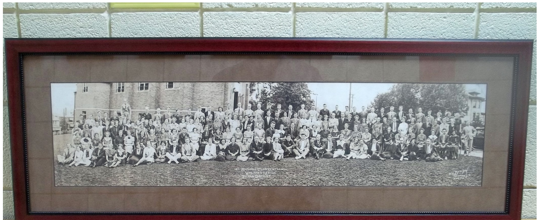
1936 Walther League Picture, on the grounds of Concordia Lutheran Church, Brentwood

Worship services are available on our YouTube site, as well as a mid-week devotional every Wednesday morning at 11:00 a.m. Simply go to www.youtube.com , and type in "Concordia Pittsburgh," to see past services, and catch each Sunday's new service. Any announcements regarding our "re-opening" will go through our e-mail prayer chain to members, and that announcement will also be noted on YouTube for all others. Plans are to upgrade our camera equipment, and to continue on-line services for our shut-ins, who have greatly appreciated this unexpected "blessing," of the Corona Virus.