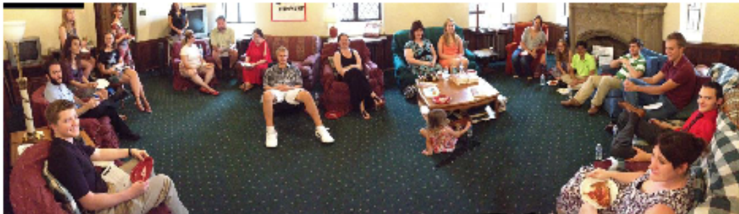
CMU, Pitt, PPU, Duquesne, CCAC, & Chatham students enjoy weekly lunch together after Worship