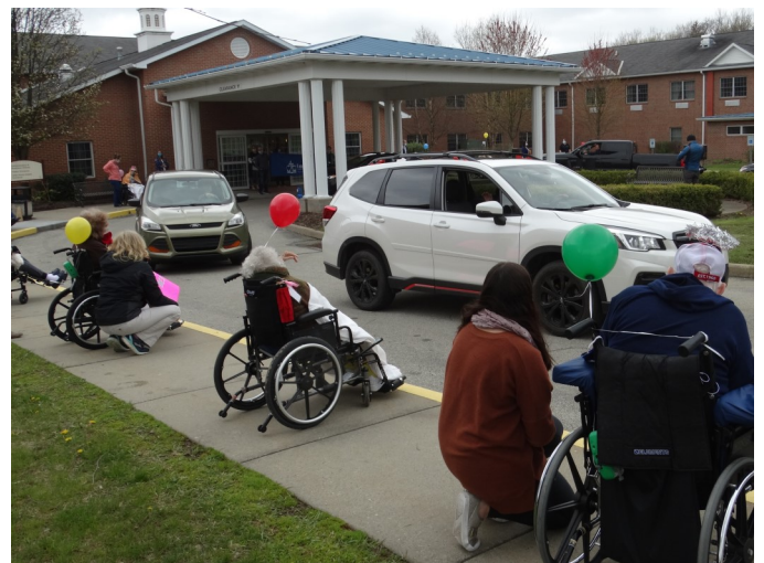
Cabot Lund Care Center residents enjoyed wave parades from friends and families.