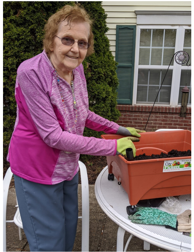
The Concordia of Cranberry residents garden club took advantage of nice weather recently and planted tomatoes, green peppers, zucchini and strawberries.