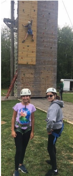
RLHS freshmen girls wait their turn for the ropes course at Camp Pioneer

Redeemer’s two campuses opened the doors for the first day of school on Wednesday, August 21. Our middle and high school students began the year with their annual teambuilding retreat. This year’s retreat was held at Camp Pioneer, a Christian camp along the shores of Lake Erie in New York. Students participated in devotional times, outdoor games, and other activities to encourage leadership and bonding.