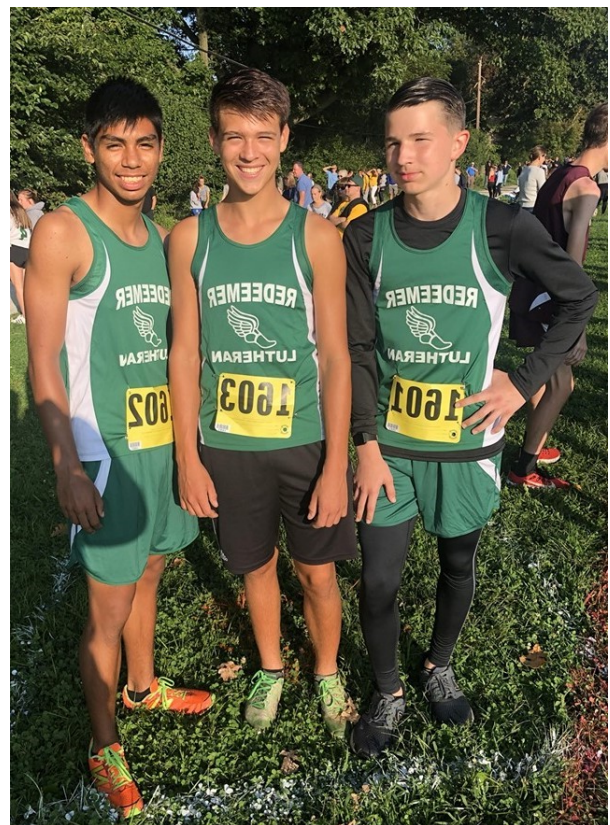
RLHS cross country boys preparing for a race at Schenley Park

With the advent of the school year comes the fall athletic season! The volleyball, soccer, and cross country teams began practicing before school began, and have been busy ever since, with games, matches, and meets taking place all around the greater Pittsburgh area. The high school cross country team competed in the Red, White, and Blue invitational at Schenley Park on September 7. Each team member posted a “PR”—their personal best time!