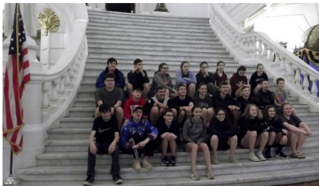
7th & 8th grade class trip

The 7th and 8th grade students went on their class trip to Gettysburg/Harrisburg/Hershey on May 2 and 3. Students and chaperones traveled 200+ miles to reach their historic destination where they explored many sites, including the Gettysburg Battlefield, the Shriver Museum, the Soldiers' National Cemetery, and also visited our state capital in Harrisburg. As a fun side trip, they toured Hershey Chocolate World and rounded out the day at Hershey Park. It was a memorable trip for everyone. Thank you, Lord, for great weather, good times, patient chaperones and safe travels back home to western PA!