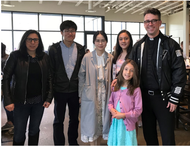
Easter Sunday lunch, Chinese students April 2019

None of this would be possible without your continued prayers and ongoing financial support. Thank you! CURRENTLY WE ARE IN GREAT NEED OF MORE GIFTS AND LARGER GIFTS. Please make checks out to First Trinity with "Campus Ministry" in the memo line, and mail to: Campus Mission, 535 N. Neville St., Pittsburgh, PA 15213. You can also donate online: scroll about halfway down at www.LSFPgh.com/donate . If you are a Thrivent member, please contribute through Thrivent Choice to "Lutheran Student Fellowship of Pittsburgh, PA". Thank you!