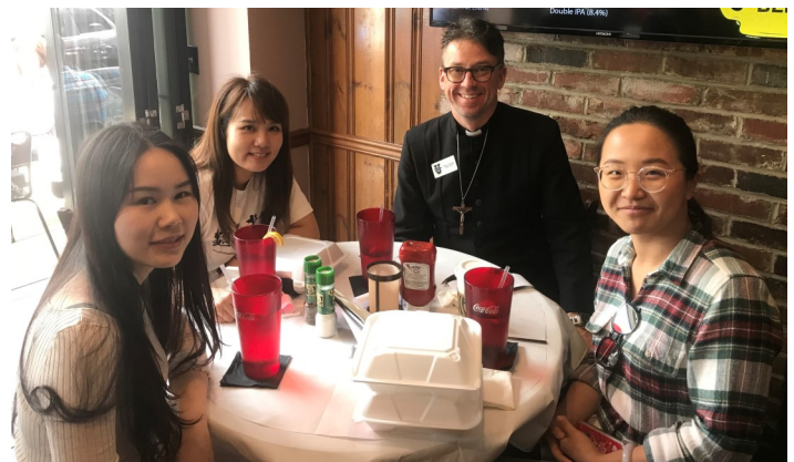
Holy Saturday lunch, Chinese graduate students April 2019