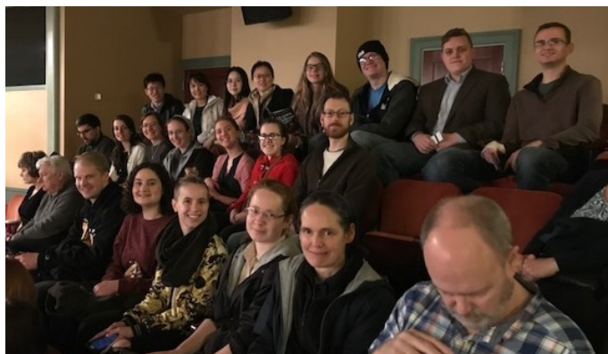
Below: Screwtape Letters play, LSF & PGH CSP-Feb. 2019