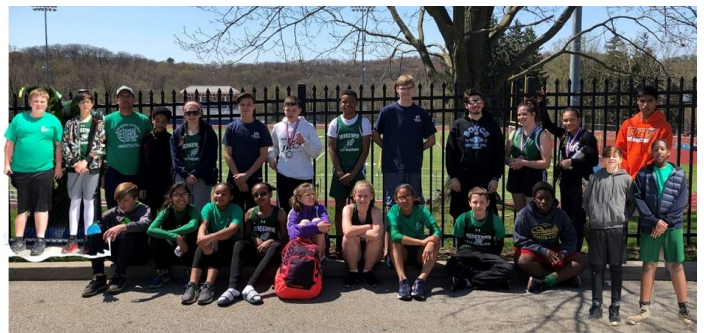
Redeemer 2019 middle/high track & field team

Congratulations to all RLS track & field team members. GO RAMS!!