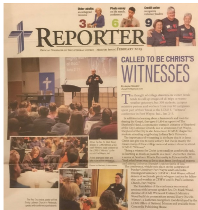
Above: Reporter February 2019 Andrae cover