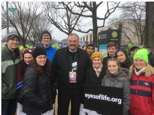
RLHS students & administration attend the March for Life