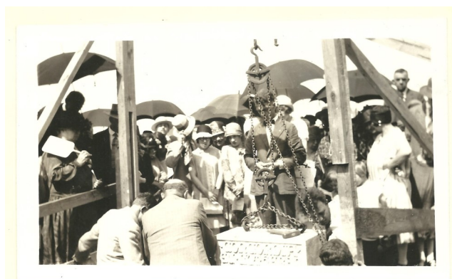
+ The Laying of The Cornerstone - Concordia +

On January 18, 1924, a group of 125 interested Lutherans met at the GBU (German Benefits Union) Building in Carrick to discuss the formation of a congregation for the growing South Hills area of Pittsburgh. Those original members came primarily from the former St. Paul's, Southside and former Trinity, Mt. Oliver, congregations. With sufficient interest shown, the Concordia mission congregation held its first service in the basement of Elroy Elementary (two blocks from its present location on Brownsville Rd.) that last Sunday in February. One hundred twenty original members signed Concordia's charter following that service.