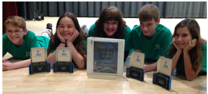
Redeemer Robotic Rams middle school team takes 1 st place in all categories in competition