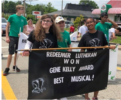
RLS participates in the Penn Hills Memorial Day Parade