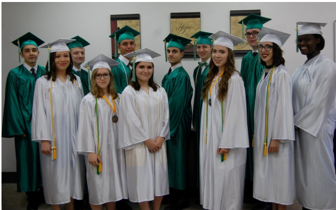
The Redeemer Lutheran High School Graduating Class of 2018