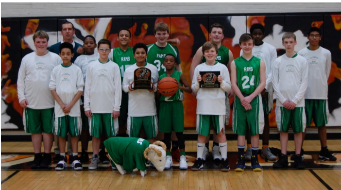
Redeemer Rams middle school boys' basketball, SWCAC Middle School Champions.