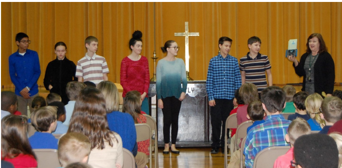
Redeemer Robotic Rams win the Robotics VEX IQ Excellence Award.