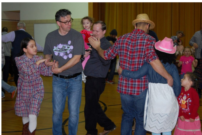
Boot-scootin' fun at the Redeemer Father/Daughter Hoedown

On Friday, February 16, Redeemer hosted our biennial Father & Daughter Hoedown. Preschool-4th grade girls and their dads or dad "subs" (grandfather, uncle, big brother, family friend, etc.) took part in a wonderful night