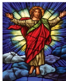
A Christian devotion meditating on the Resurrection of Jesus based on Scripture incidents in the four Gospels and Acts using Scripture readings, songs and musical pieces by area Lutheran church participants.

| | | SUNDAY APRIL 8, 2018 2:30 p.m.—Concordia at Rebecca 4:00 p.m.—Concordia Highpointe | |