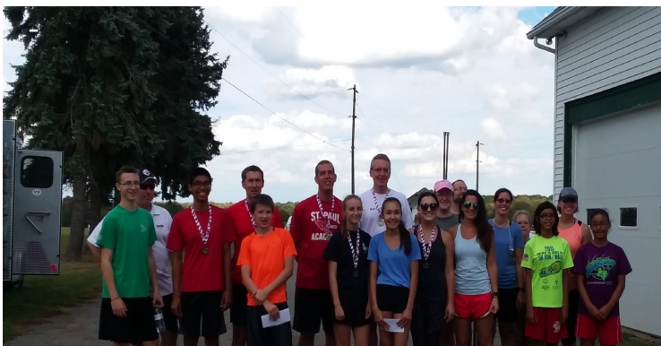
Pittsburgh Area Lutheran Schools: Helping to build a Child's Faith, Body, and Mind.