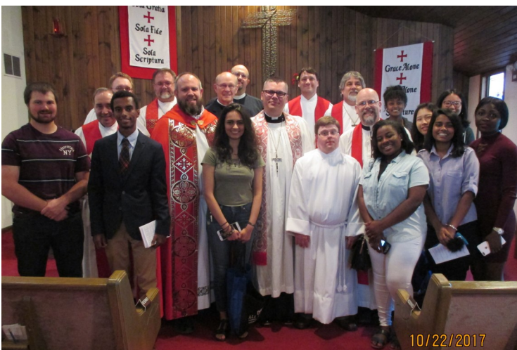
The 40th Anniversary of All Saints Lutheran Church and Student Center