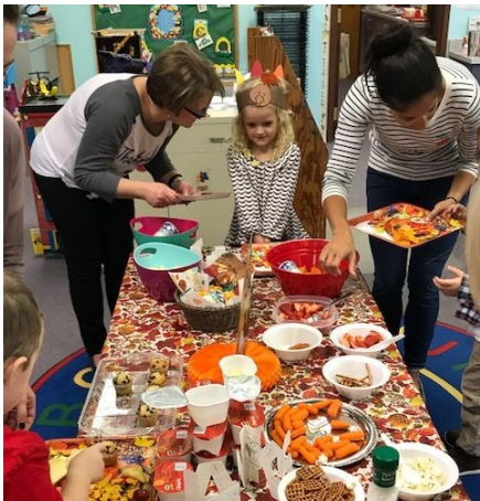
Trying to decide what to eat.....so many choices!