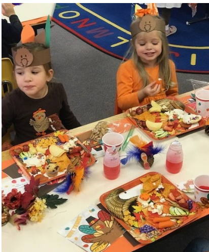
Children enjoying their feast at the "Thanksgiving table" they created.