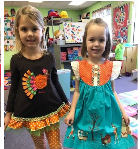
Look at these two cuties showing off their beautiful Thanksgiving dresses.